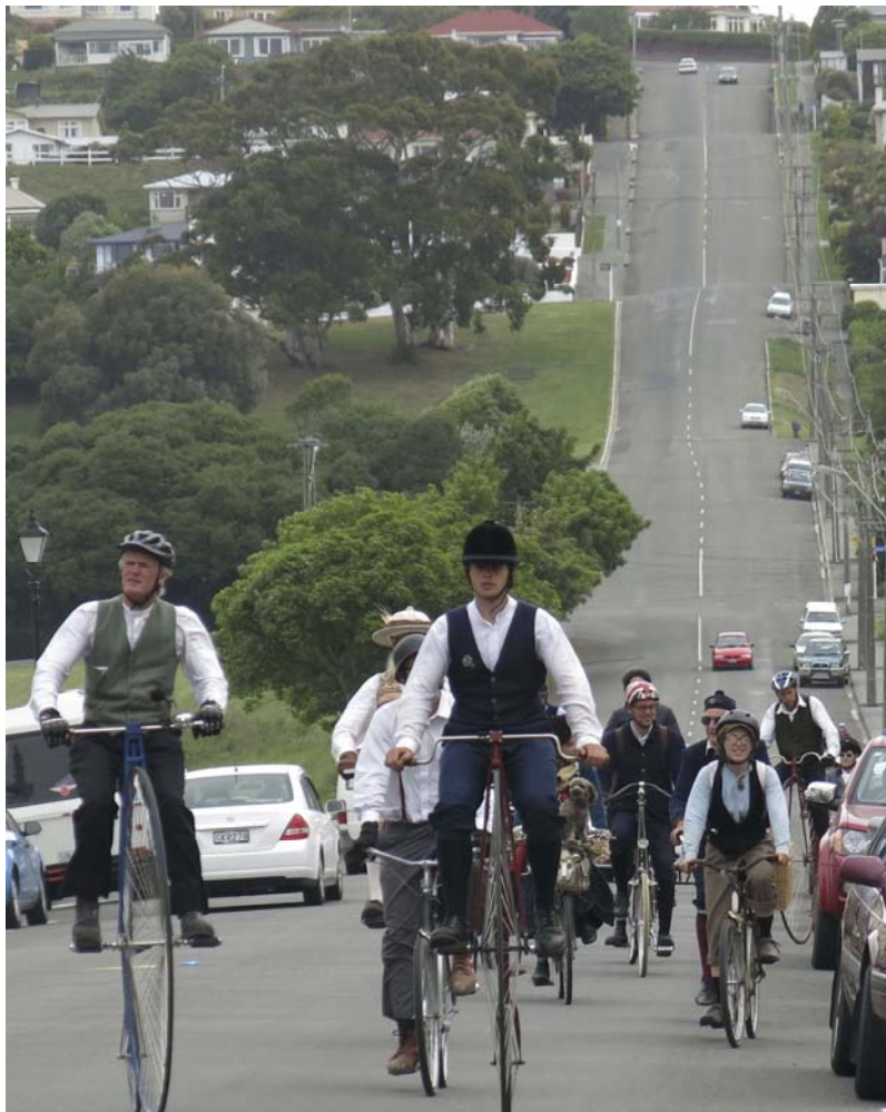
The cyclists complete the circuit of the precinct and head back to the Scottish Hall. I included this picture as it gives a good view of Tyne Street in the background. One of the events in the Penny Farthing competition was the Tyne Street Grunter to see who could reach the farthest point before having to get off their bike! Unfortunately I missed this event but I understand that the winner almost made it to the first plateau.