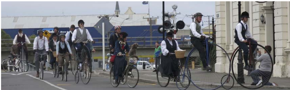
The cyclists arrive in the Heritage precinct.