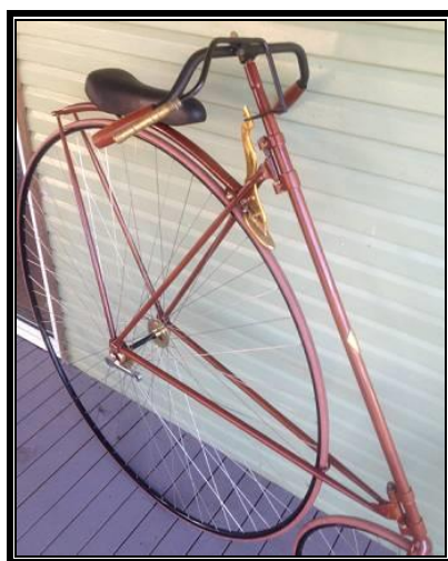
Eagle 50" wheel $3500