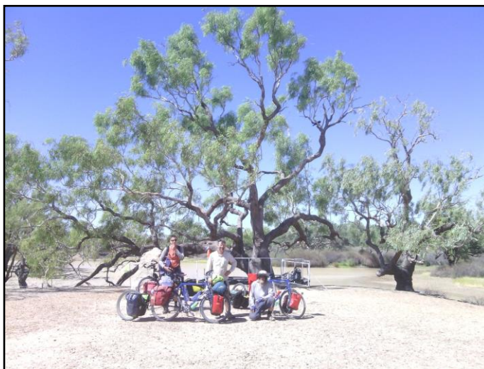
Bushwhackers at the Dig Tree

After long days in the saddle camping without washing, making it to the Cooper Creek was a welcome sight. It's a lesson in appreciating the small things in life when you are exposed to the elements. I splashed my body and washed my clothes (for the only time in the trip) in the Cooper. Cathartic. A 28km detour to visit the Dig Tree was well worth the effort. Interestingly some were visiting by light aircraft as the site includes an airstrip! I was able to squeeze in my botanical specimen bag and now have some choice Eucalypt leaves for a wool dying project. Especially prized are the leaves gathered from beneath the Dig Tree, Eucalyptus microtheca (Coolabah).