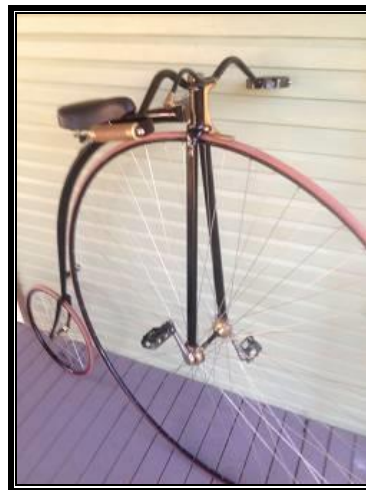
50" Penny Farthing $3000