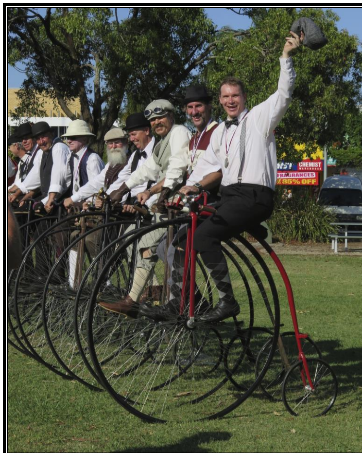
Greetings from QPHAHCC's 2015 Penny Stack