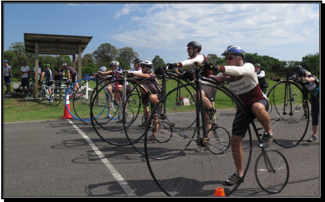
Starting line up at the 2014 QPF Championships

cheered along our penny riders, enjoying the unique event slotted in between their high speed Criterium races.