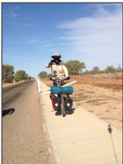
3km cycle path into Birdsville

Innamincka at last - what a ride! The bitumen finishes at the boarder so 30kms into Innamincka South Australia is unsealed hard, hard, hard riding. Sand, stone and corrugation. Oh I didn't mention the flies. Once at Innamincka and camp set up next to the river, the pub naturally became a magnet for wonderful meals especially as this was our only scheduled rest day. Corellas and galahs screeched themselves senseless day and night, yes a reminder of outback Australia.