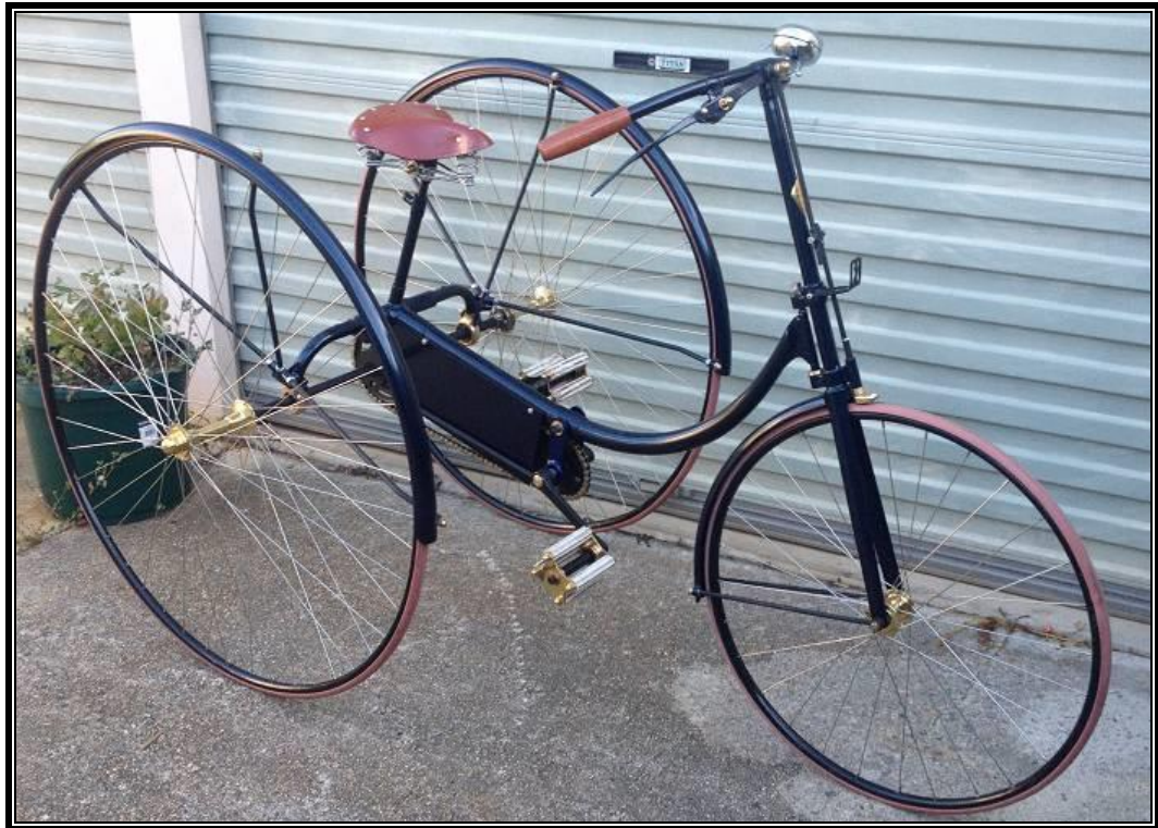
Tricycle, based on the 'Cripper' design.