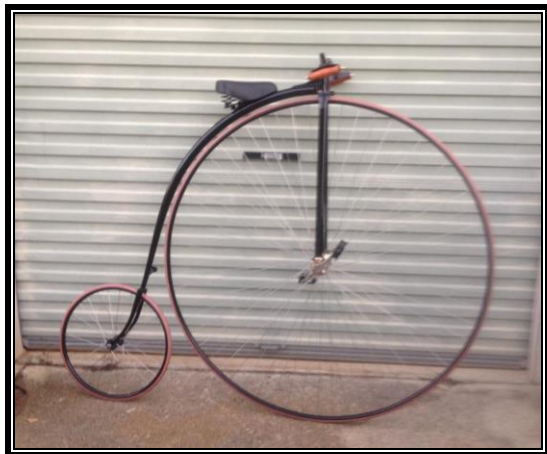
52" Penny Farthing $3000