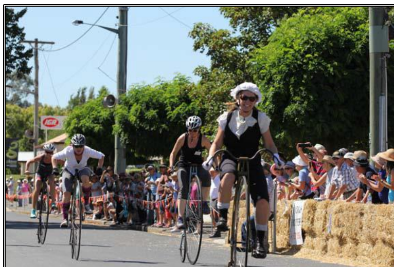
Ladies Sprint, Evandale 2015

Results table and photo courtesy of The Velocipedist, Issue 159, March 2015