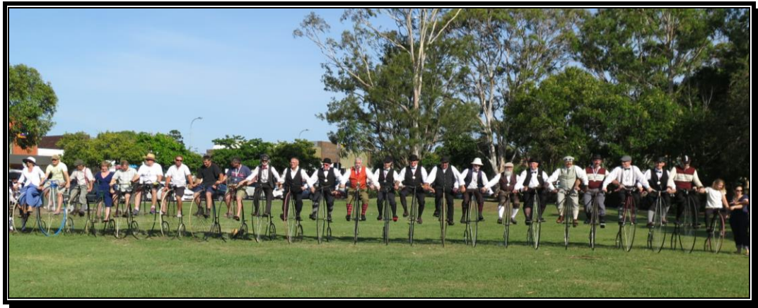
Pennies by the Sea 2015 - Penny stack event

What better time of year than the Queensland autumn to don our tweeds and long woollen socks, perhaps grow some facial hair, mount our mighty highwheels, tricycles and safeties and show the world how cycling used to be. This edition of Unchained brings you reports of QPFAHCC activities including the club's signature event, Pennies by the Sea, a few snippets from our friends interstate and our first Member Profile.