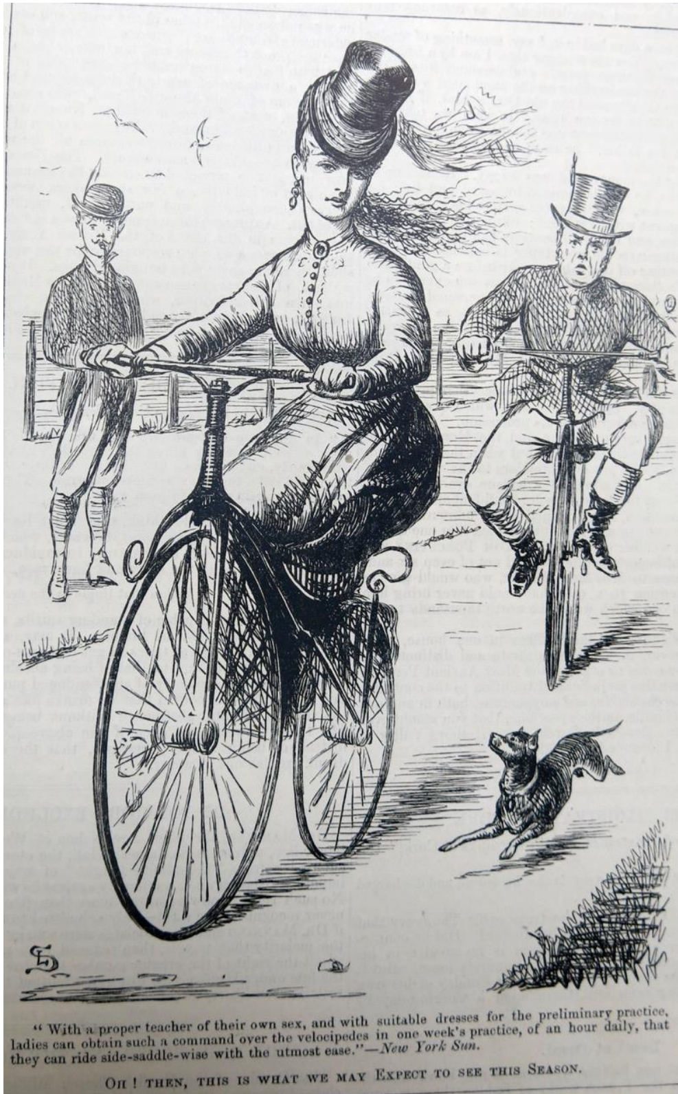
Punch Magazine