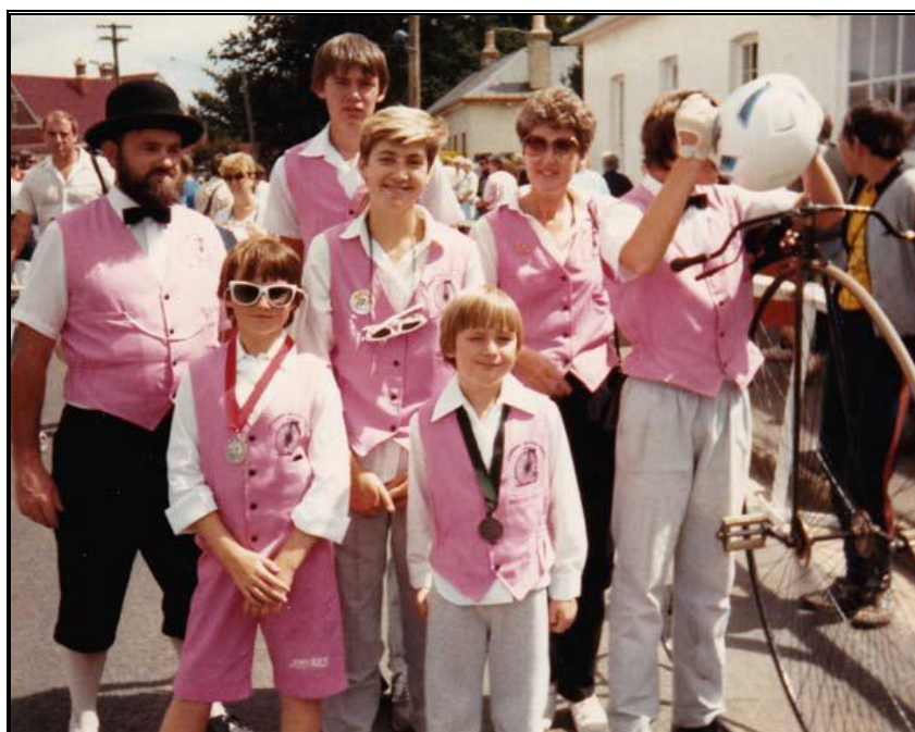
This article and photo courtesy of The Velocipedist Issue 160 April 2015.

Our condolences have been forwarded to Rod and the Driver family.