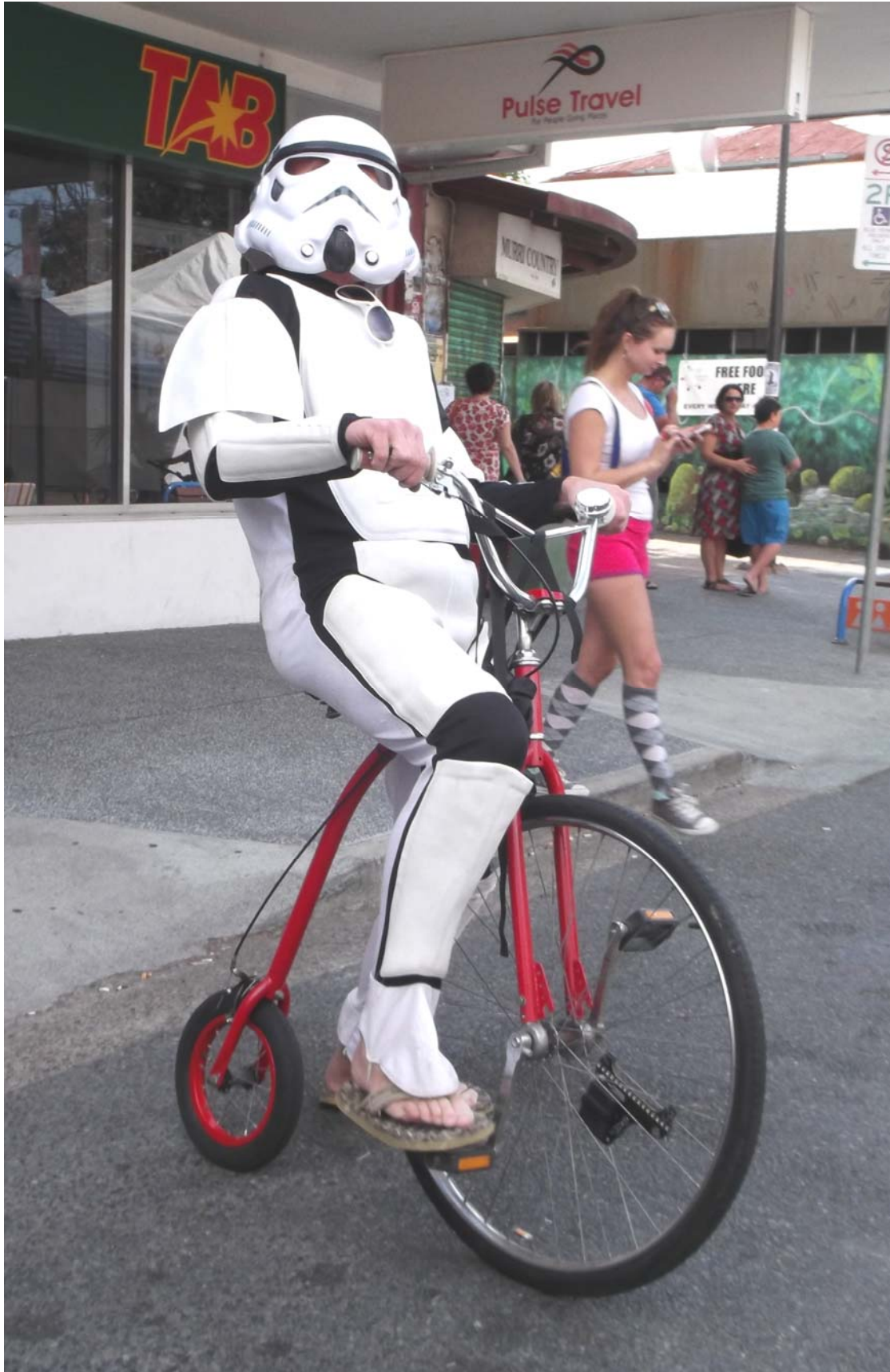
The Galactic Empire well represented at the Kurilpa Derby 01 September 2013