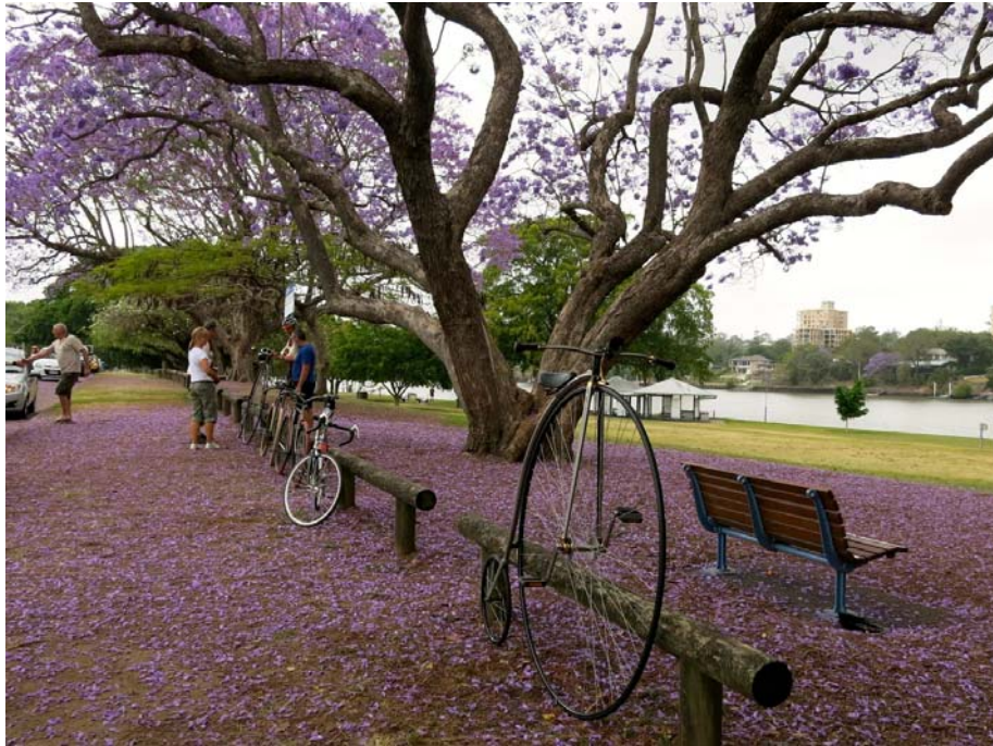
What a beautiful venue to gather, at Orleigh Park, ready for a ride along the riverfront at West End.