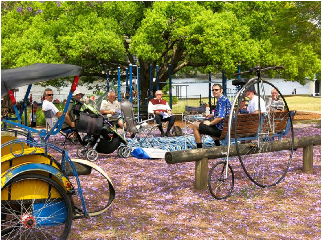
.. and then the formalities of the monthly meeting in the park.